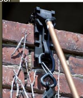
Pole holder not included